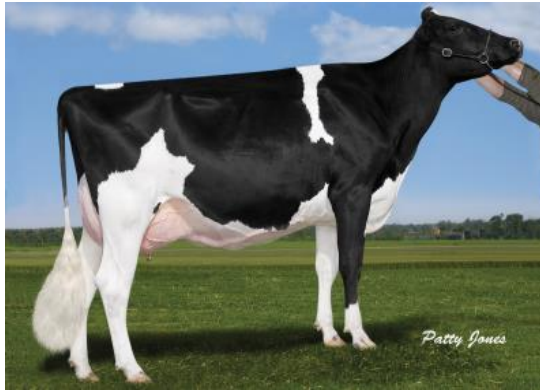
MGGD: Comestar Goldwyn Lilac

Sire: De-Su Bkm Mccutchen 1174-ET TV TL TY TD Dam: Maple Wood Sudan Licorice VG-86 02-05 2x 236d 21320m 4.3 926f 3.6 761p MGS: Va-Early-Dawn Sudan Cri-ET TV TL TY MGD: Maple Wood M O M Lucy VG-86 02-02 2x 354d 31561m 4.7 1470f 3.1 973p MGS: Long-Langs Oman Oman-ET TV TL TY VG-86 MGGD: Comestar Goldwyn Lilac VG-89 04-06 2x 365d 50606m 4.6 2308f 3.2 1643p